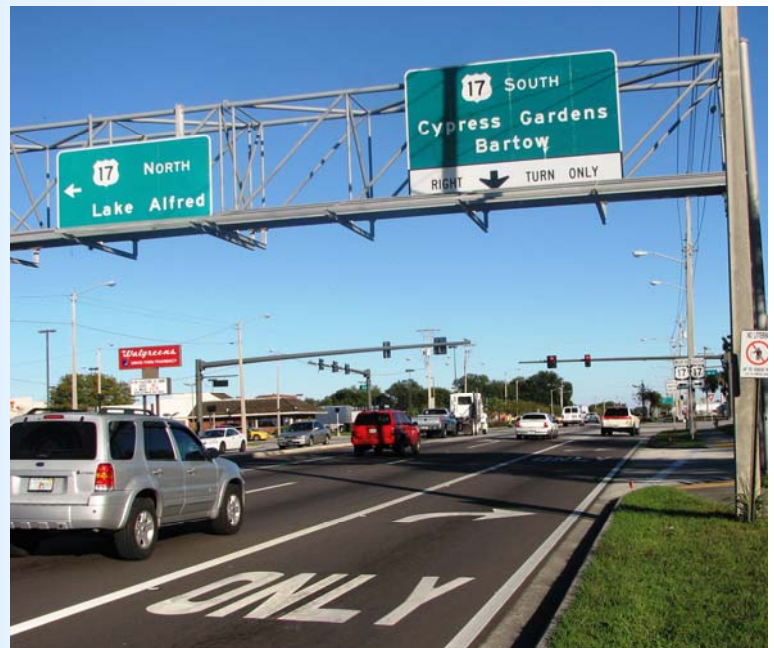
The intersection at Havendale Boulevard and U.S. Highway 17 North is one of the major intersections included in the Winter Haven traffic management improvement project.

When finished, three hubs will be equipped for traffic monitoring, each located at an existing City facility. Some major intersections where traffic will be improved are: Ha-